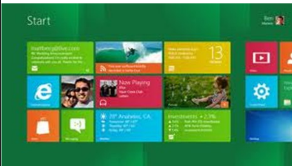
Preview of Windows 8 Desktop

At each change of year we both look back and also look forward. We had some great programs in 2011 and we are assured that will continue all through 2012. Further afield we lost some leaders in 2011 such as Steve Jobs who revolutionized consumer electronics by defining new products and new markets for them. I am listening to the Steve Jobs biography via audible.com and I suggest that you either pick up the book at the book sellers or download the audio version as I have done. It is a fascinating look into how the big computer companies evolved over the last 20+ years and offers us a unique view into Steve Jobs character, values and morals. Others that passed away are Kenneth Olsen of DEC. We also lost John McCarthy who invented early programming language Lisp and coined the term 'artificial intelligence'. Another early programming language expert to pass away is Daniel McCracken who was the authoritative figure for Fortran. The C programming was invented by Dennis Ritchie, alas he is gone also. We can look forward to huge changes in technology, will Google continue to make strides or stumble? Will Facebook overshadow all other tech companies? Which new company will threaten all of these as we go through the year?