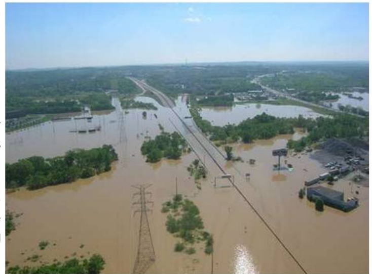
Vietnam Veterans Blvd looking towards Hendersonville from Rivergate Mall

The business and physical landscape of Nashville took a body blow as biblical downpours fell on us for 2 straight days. Less than a month later only two main attractions remain closed in Nashville, the Schermerhorn Symphony Center downtown and the Gaylord Opryland complex at Two Rivers. The greatest tragedy isn't the damage to the fabric of the city, but the 20 lost lives of flood victims. Please join me in remembering and praying for the victims and their families.